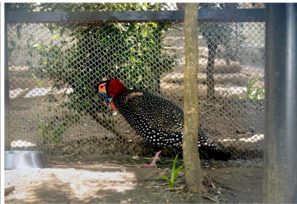
A captive western tragopan at the Sarahan Pheasantry.