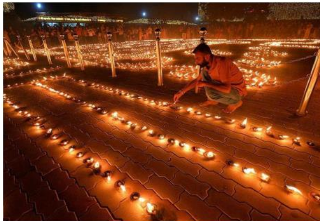
Living heritage: Deepavali thrives through the contributions of potters crafting traditional earthen lamps. VIJAY SONEJI

acknowledges Deepavali as a living heritage that strengthens social bonds, supports traditional craftsmanship, reinforces values of generosity and well-being, and contributes meaningfully to several Sustainable Development Goals.