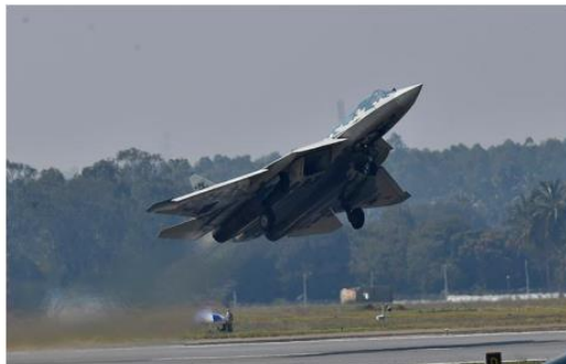
Russia's Su-57E fighter jet takes off during the inauguration of AERO INDIA 2025 in Bengaluru in February.

"India didn't show much interest in the equipment offered by Russia. The Russians were expecting major movement on the sidelines of the visit