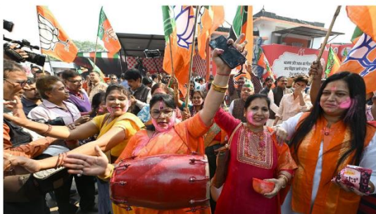
Election outreach: BJP supporters celebrating after the party's victory in Patna on November 14.

In digital elections, reach is shaped as much by who speaks as by how much is spent. Third-party actors not only outspent parties and candidates but also achieved far greater visibility. Despite near-identical average spending, their campaigns generated almost twice the average impressions of official parties and candidates (Table 1).