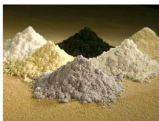
Rare earth oxide powders are typically heavy and gritty; clockwise from top-left: praseodymium, cerium, lanthanum, neodymium, samarium, and gadolinium.

Every good permanent magnet needs to have two things: a large magnetisation,