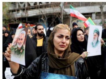
A funeral was held for security personnel killed during protests, in Tehran on Wednesday.

Mr. Trump has repeatedly warned that the U.S. may take military action over the killing of peaceful protesters, just months after it bombed Iranian nu-