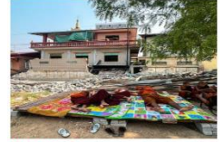
Shaky ground: Marks rest next to a damaged building following a strong earthquake in Sagging, Myanmar on April 2, 2025.

The first half witnessed the costliest loss period ever for the insurance industry.