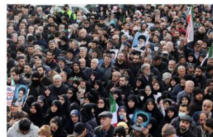
People attend the funeral of the security personnel killed in the recent protests, in Tehran.

"It is reiterated that all Indian citizens and PIOs should exercise due caution, avoid areas of protest or demonstrations, stay in contact with the Indian Embassy in Iran and monitor local media for any developments," the Embassy of India in Tehran said, urging all Indian nationals carrying passports and other identification documents to contact the embassy for assistance.