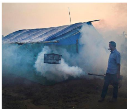
Need for action: A health worker using a fogging machine in Assam as part of preventive measures against vector-borne diseases.

But is the elimination goal within target at all? In fact, India has set itself the target