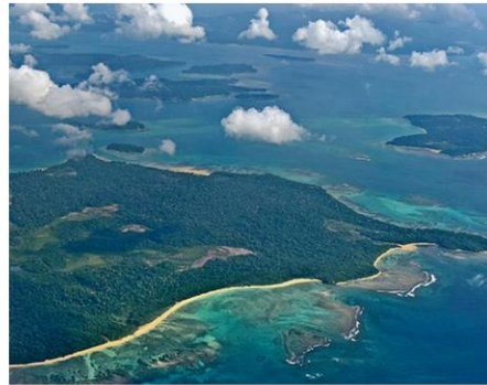
Tribal Council members say they were asked to sign a surrender certificate, giving up their ancestral lands. FILE PHOTO

In an online briefing to journalists, Tribal Council members said they had been called for a January 7 meeting with Nicobar district administration officials, where they were orally asked to sign a "surrender certificate", giving up their ancestral tribal lands. Hours after the briefing, they were summoned for another meeting where they were asked if they would give up their