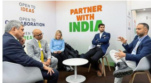
Union Minister Ashwini Vaishnaw with leaders in the fields of AI, robotics, and cybersecurity in Davos on Thursday.

He said a continuous reform process was under way across all sectors of the economy, adding that