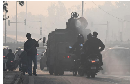
People commute on their vehicles amid smog on a cold winter morning in New Delhi on Wednesday.

The report does not identify any new sources of pollution. Experts compiled existing studies after the Supreme Court, on Ja-