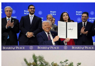
New accord: U.S. President Donald Trump holds the founding charter of the Board of Peace in Davos on Thursday.

India was among the countries not present at the ceremony. Prime Minister Narendra Modi was among the numerous global leaders invited by Mr. Trump to join the Board.