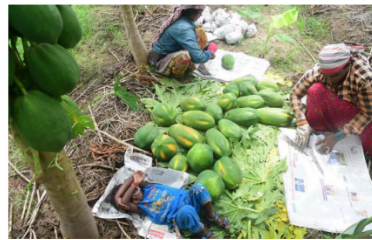
A woman labourer, who is busy plucking fruits in an orchard, arranges a soft bed for her child, near Chiravuru in Guntur, Andhra Pradesh.

It is a double whammy. You don't get help at