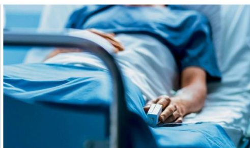
The focus of a living will is specifically for situations in which the person develops a medical condition that is terminal or irreversible. Without a living will, many terminally ill patients spend their final days in the ICU, attached to numerous tubes, unable to speak, and cared for by strangers, 24/7

Most people would expect their family members or close friends to step in and take the right decisions along with the doctors. However, in reality, the situation can turn chaotic because of emotional conflict, guilt, differences of opinion and contrasting attitudes among several decision makers—at the end of which doctors will often take the easier route