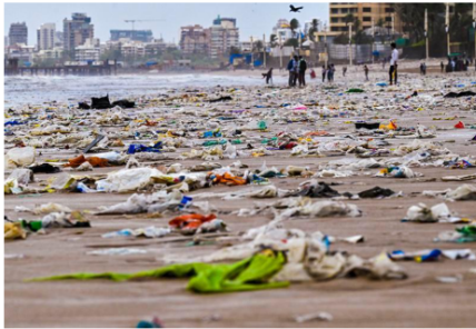
Environmental hazard: Banned single-use plastic covers and other waste littered across the Juhu beach in Mumbai.

The survey teams assessed the on-ground effectiveness of the ban across a wide range of establish-