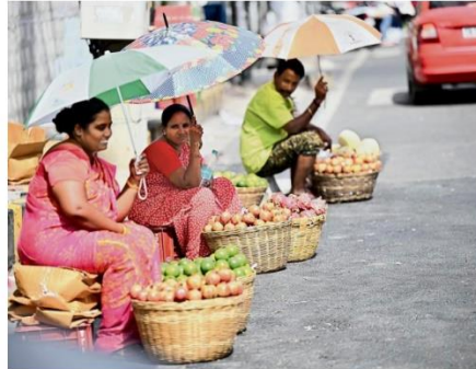
Big impact: Vulnerable communities — including rural populations, informal workers, women, and children — face the biggest impact of climate change. K.V.S. GRI

Unequal burden The impact is not evenly distributed. Vulnerable communities — including rural populations, informal workers, women, and children — face the greatest risks. These groups are often the least equipped to cope with climate shocks, deepening existing inequalities. Extreme heat, for instance, reduces labour productivity and increases health risks for outdoor