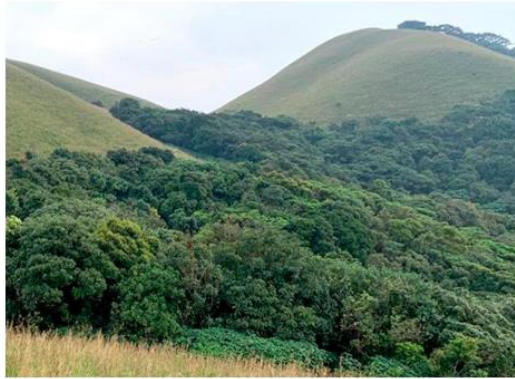
Wake-up call: Climate change is silently rewriting every sector, including our forests, say scientists. SPECIAL ARRANGEMENT

For this study, the authors used modelling to peer into the future and found that vegetation carbon biomass rises by 35% under a low-emissions future, 62%