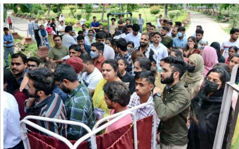
Civil service aspirants wait outside an examiners centre as they arrive to appear for the UPSC preliminary exam, in Jamnā, in March 2024. (AI)

According to Dr. Mishra, such protracted preparation shifts stress from acute phase to a persistent background state of cognitive load, decision fatigue, and reduced recovery. In so-called "prolonged uncertainty" can produce "chronic anticipatory stress", where repeated attempts without success diminish the individual's sense of control and also contribute to emotional exhaustion.