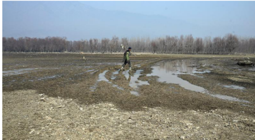
The CAG report highlighted that 315 lakes in J&K that constitute a water area of 1,537.07 hectares have disappeared. FILE PHOTO

lakes (29% of 697 lakes) had decreased by 1,314.19 hectares. The report suggested that water in 63 lakes has disappeared by "more than or equal to 50%". "Thus, there is a potential greater risk of extinction of these lakes," it added.