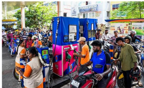
Surging price: Crude oil free-on-board price/barrel rose by over 50% in March from a year earlier.

As per India's Petroleum Planning & Analysis Cell (PPAC), crude oil free-on-board (FOB) price (Indian basket) per barrel increased by over 50% in March 2026 compared with March 2025. With the ongoing tensions in West Asia showing little sign of easing, such volatility is unlikely to remain a one-