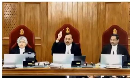
A nine-judge Bench led by Chief Justice of India Surya Kant hearing the Sabarimala temple entry issue in New Delhi on Tuesday.

The Centre has made its position clear ahead of the maiden hearing of a series of writ and review petitions linked to the Sabarimala temple case scheduled to be heard by a nine-judge Bench headed by Chief Justice of India Surya Kant from April 7. The