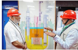
Prime Minister Narendra Modi witnesses initiation of core loading of indigenous prototype fast breeder reactor at Kalpakkam.

1950s, envisages being able to be independent of imported uranium, creating its own stockpile of suitable uranium, and eventually harnessing thorium, of which it has vast stores. The PFBR development serves as an essential bridge. "This is a historic moment," Anil Kakodkar, Member, Atomic Energy Commission and former head of the Department of Atomic Energy, told The Hindu , adding, "What this means is that we are now on our way to extract 80-100 times more energy from a given quantity of uranium." The PFBR is a 500 MW sodium-cooled, pool-type fast breeder reactor designed by the Indira Gandhi Centre for Atomic Research and built by Bharatiya Nabhikiya Vidyut Nigam Limited, both op-