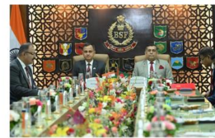
The conference was conducted in a cordial and forward-looking atmosphere, the BSF says.

"During the deliberations, both sides held detailed discussions on measures to effectively prevent trans-border crimes, including smuggling of narcotics, arms, counterfeit currency, gold and other contraband, as well as illegal border crossings and human trafficking. The two delegations also discussed issues relating to border deaths and illegal/inadvertent/forcible crossing at the border areas, construction of border infrastructure, implementation of the Coordinated Border Management Plan, confidence-building measures