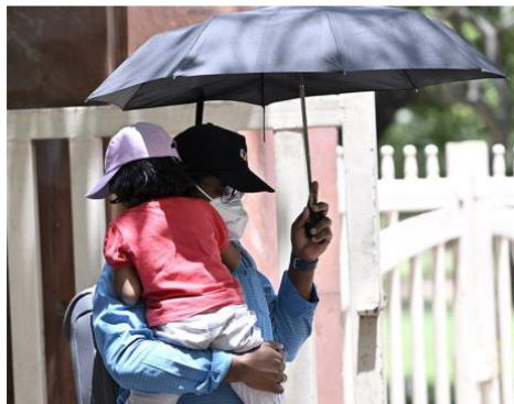
Heat is on: The warning lands at a time when India is already facing the harmful effects of the warming climate.

The warning appeared in the Mega Science Vision-2035 (MSV) report on Climate Research, a road map prepared by the Indian climate research community with the Indian In-