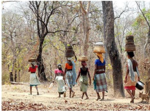
Tribal women on their way to collect forest produce in Dantewada district of Chattisgarh. FILE PHOTO

The Chhattisgarh government, on May 6, notified the task force, comprising an 18-member apex body headed by the Chief Minister and a 12-member implementation body headed by the Chief Secretary.