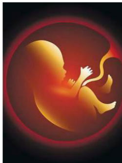
Exposure to particulate matter PM2.5 was a significant risk factor for low birth weight in Delhi, researchers find

PM2.5 and PM10 are capable of crossing the placental barrier, and cause oxidative stress and inflammation, impairing the development of the foetus. Placental dysfunction, and complications including pre-term birth, low birth weight and preeclampsia are all possible outcomes.